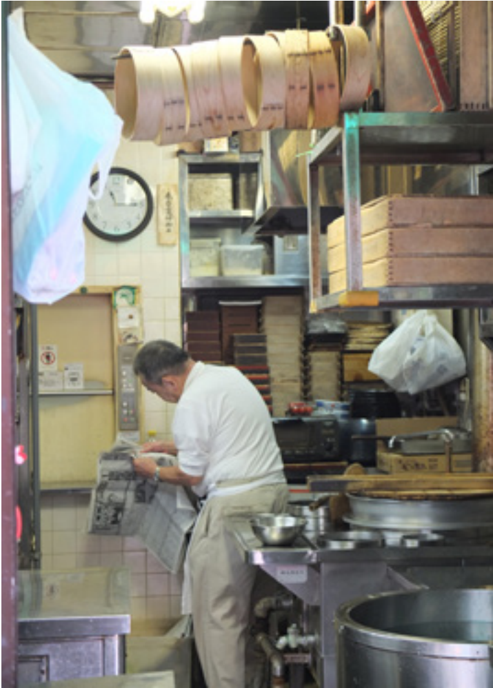
35°41'47.9"N 139°45'30.5"E Tokyo