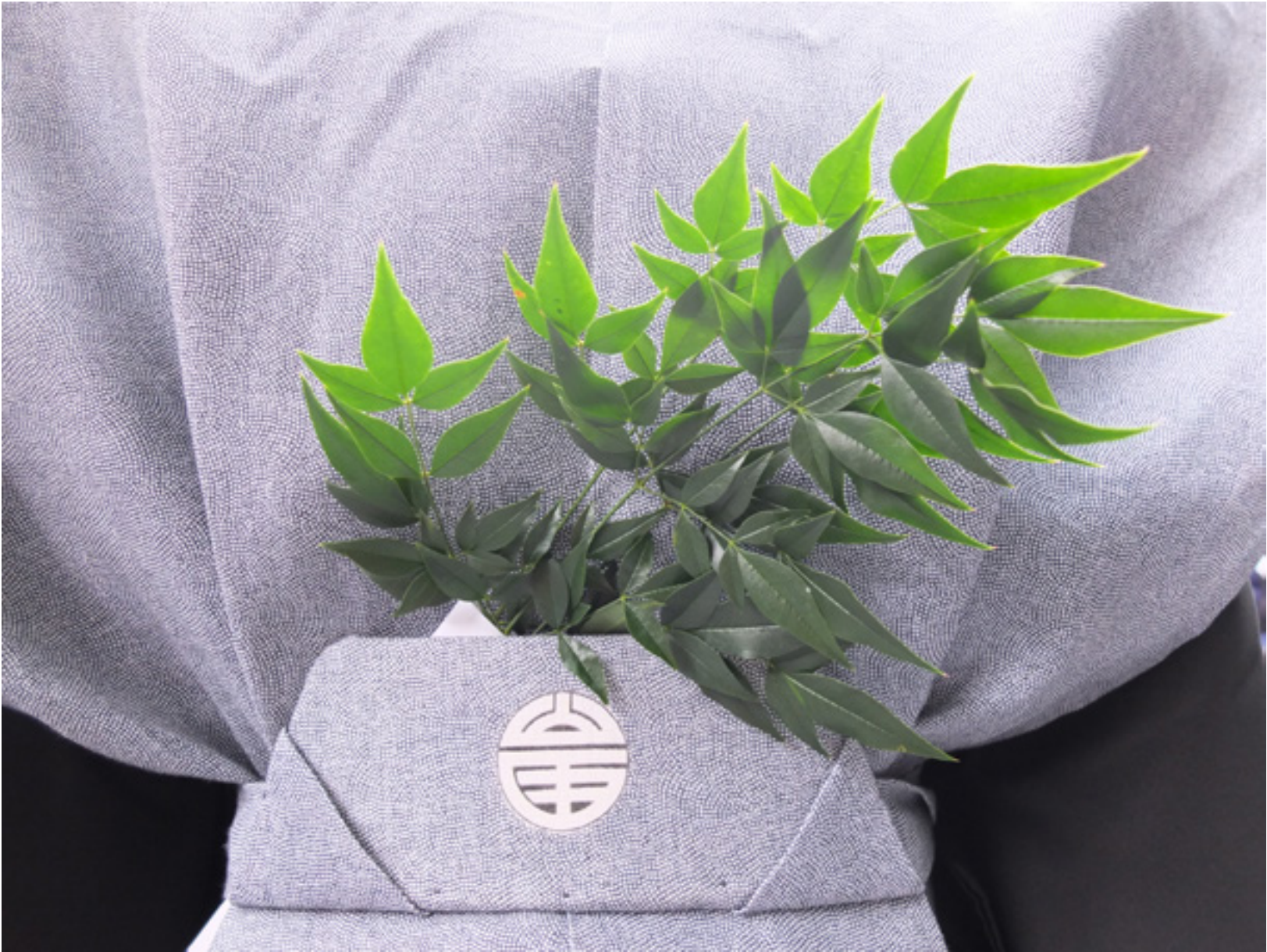
35°06'50.3"N 135°46'22.2"E Kuruma