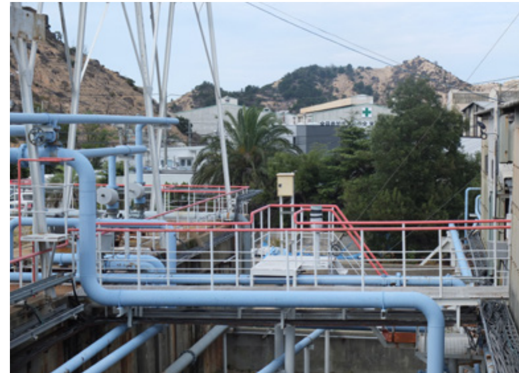
34°28'04.8"N 133°58'35.9"E Naoshima