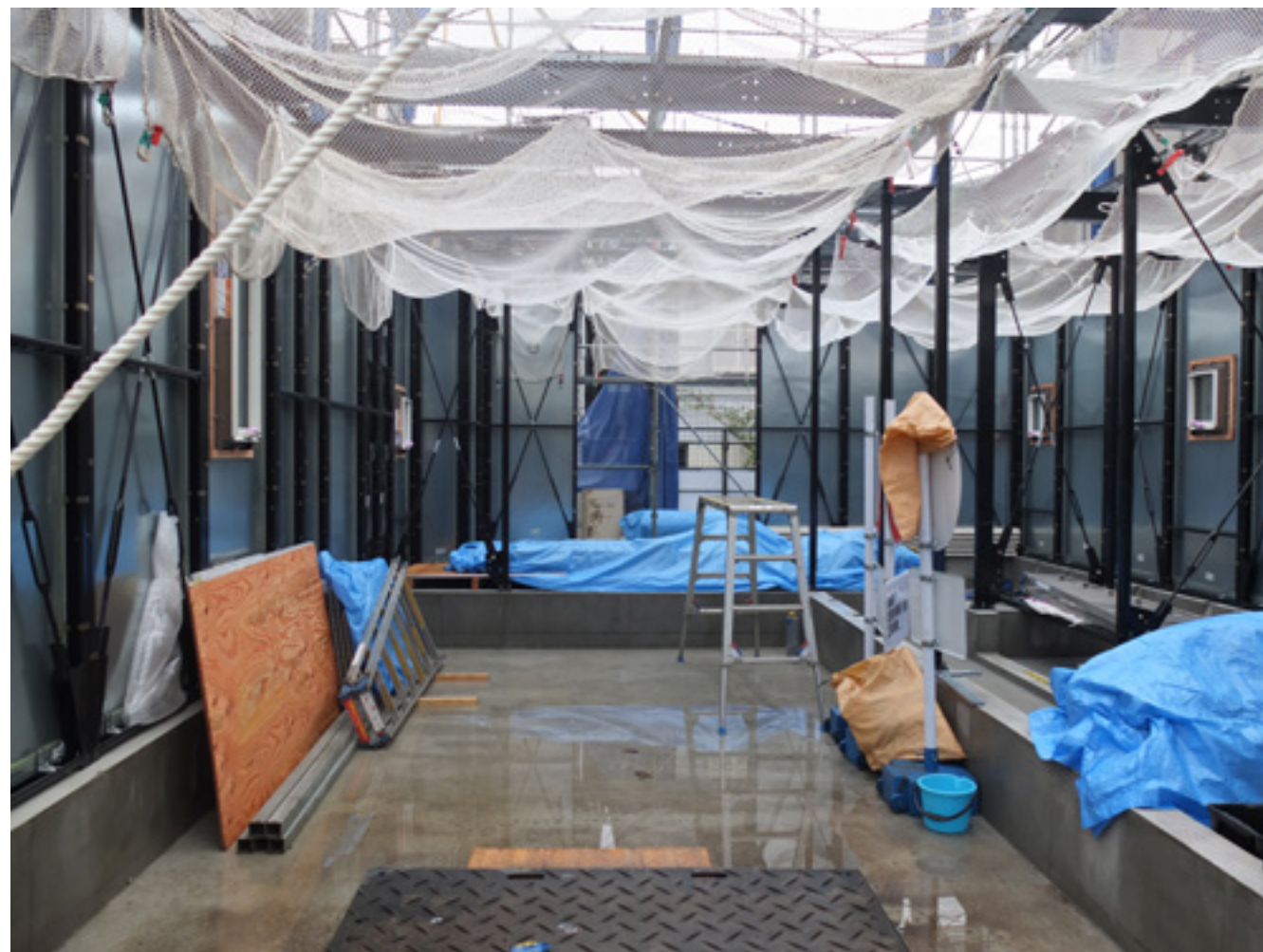
35°39'47.4"N 139°42'48.0"E Tokyo