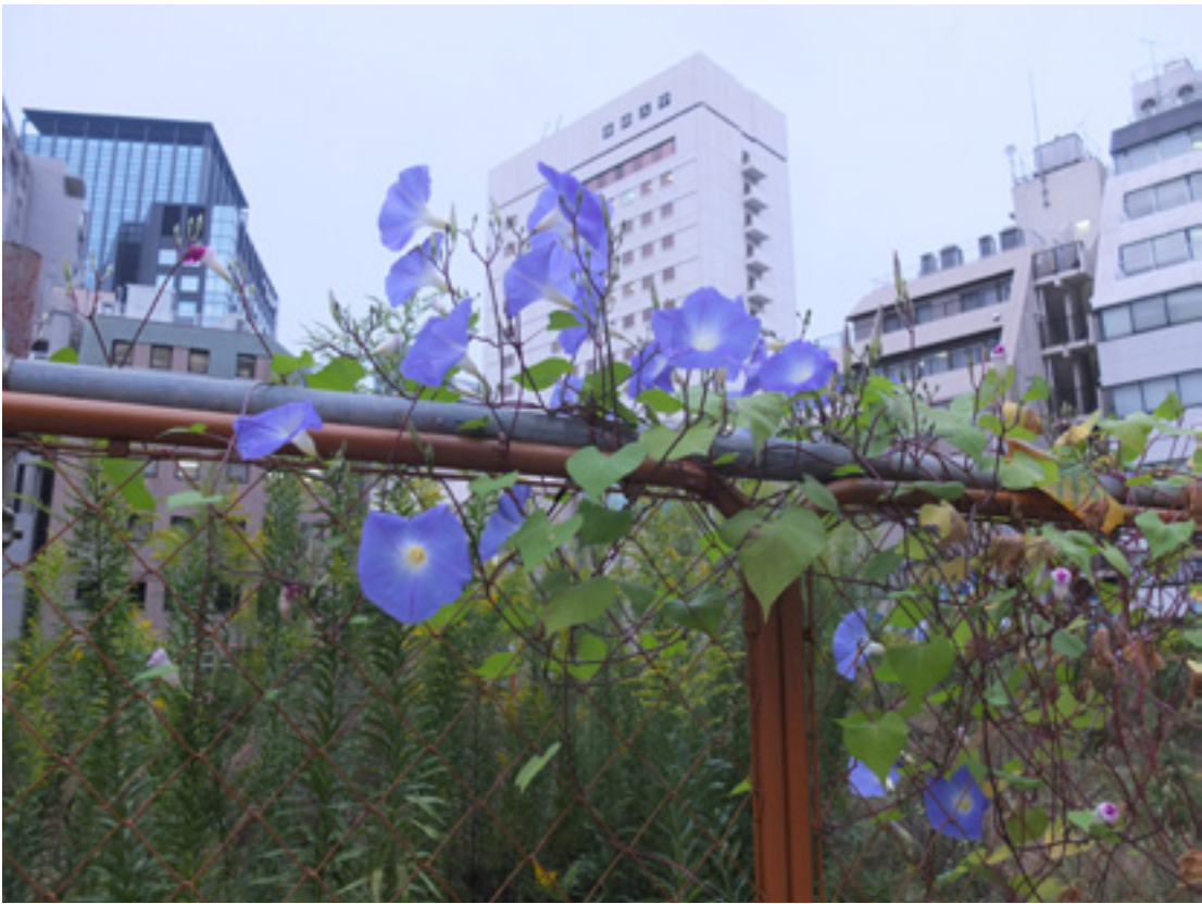
34°41'48.4"N 139°45'33.5"E Up Tokyo