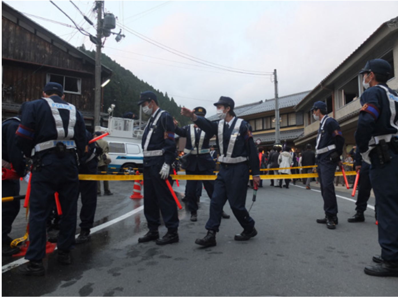
35°06'47.6"N 135°46'24.1"E Kuruma