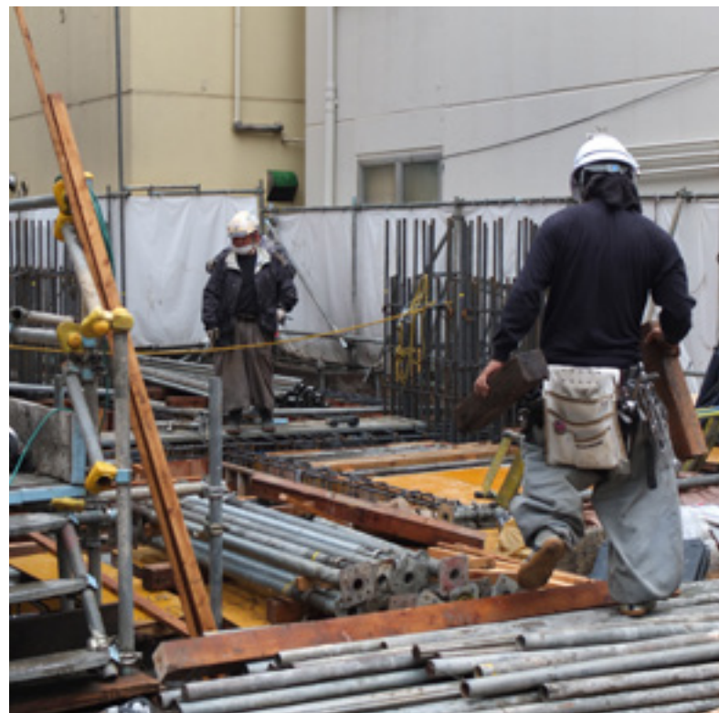
35°41'48.4"N 139°45'33.5"E Tokyo