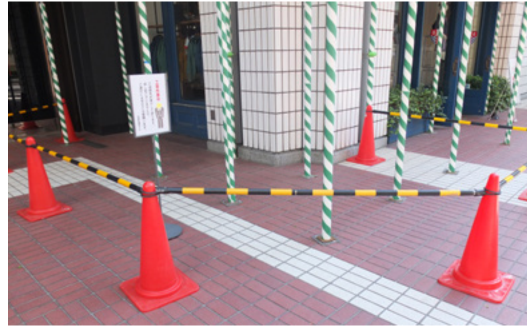
35°40'36.8"N 139°44'45.8"E Tokyo