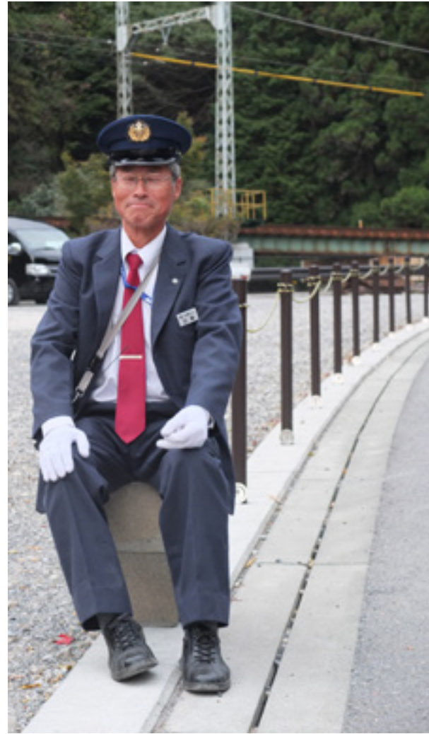
35°06'22.1"N 135°45'51.9"E Kuruma