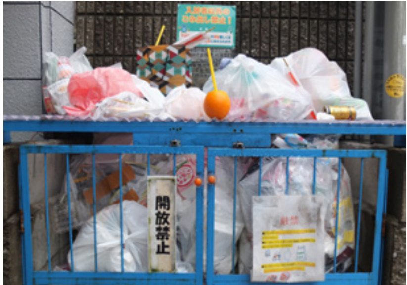
34°41'16.3"N 133°50'23.2"E Right Nara