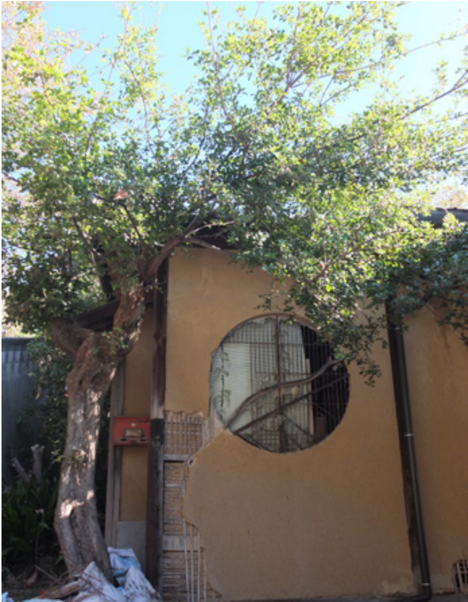
34°24'34.4"N 133°11'46.7"E Onomichi

"I realized then that only in dim half-light is the true beauty."