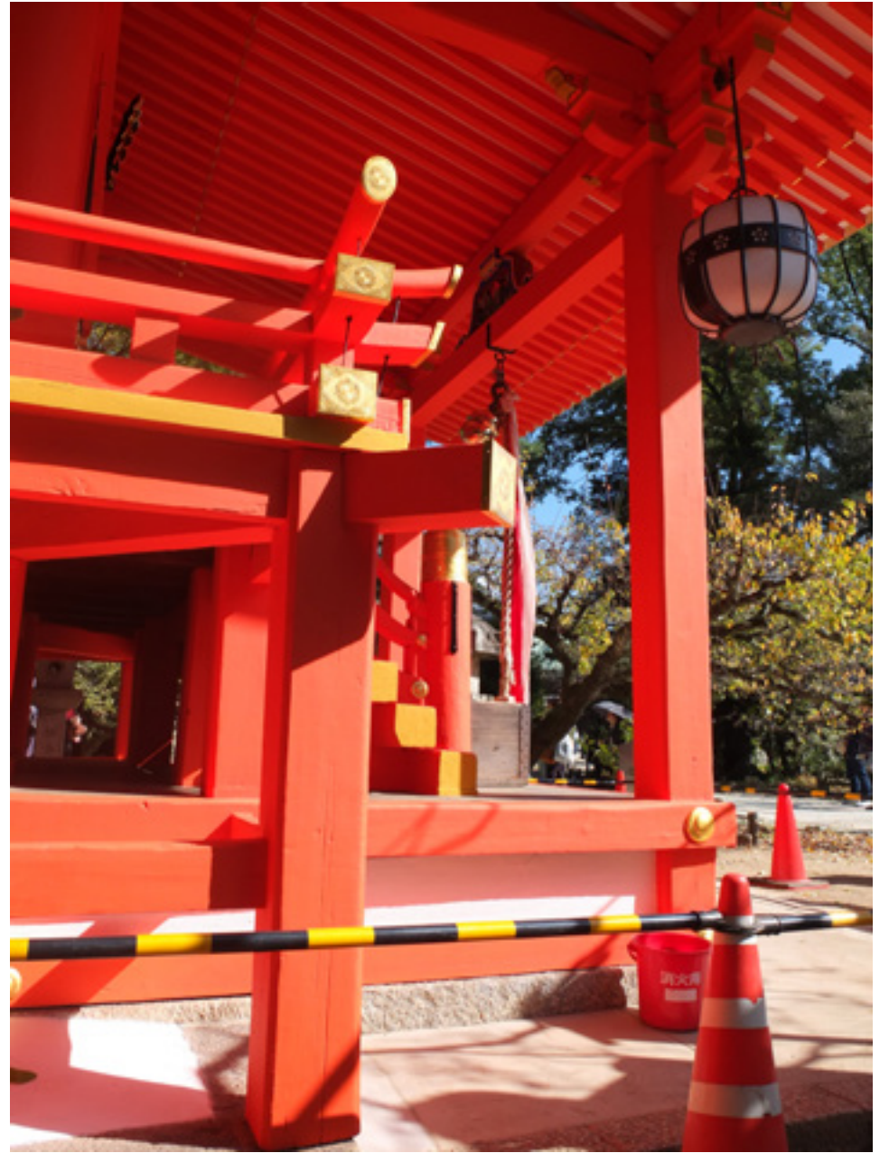
35°01'52.3"N 135°44'06.9"E Kyoto