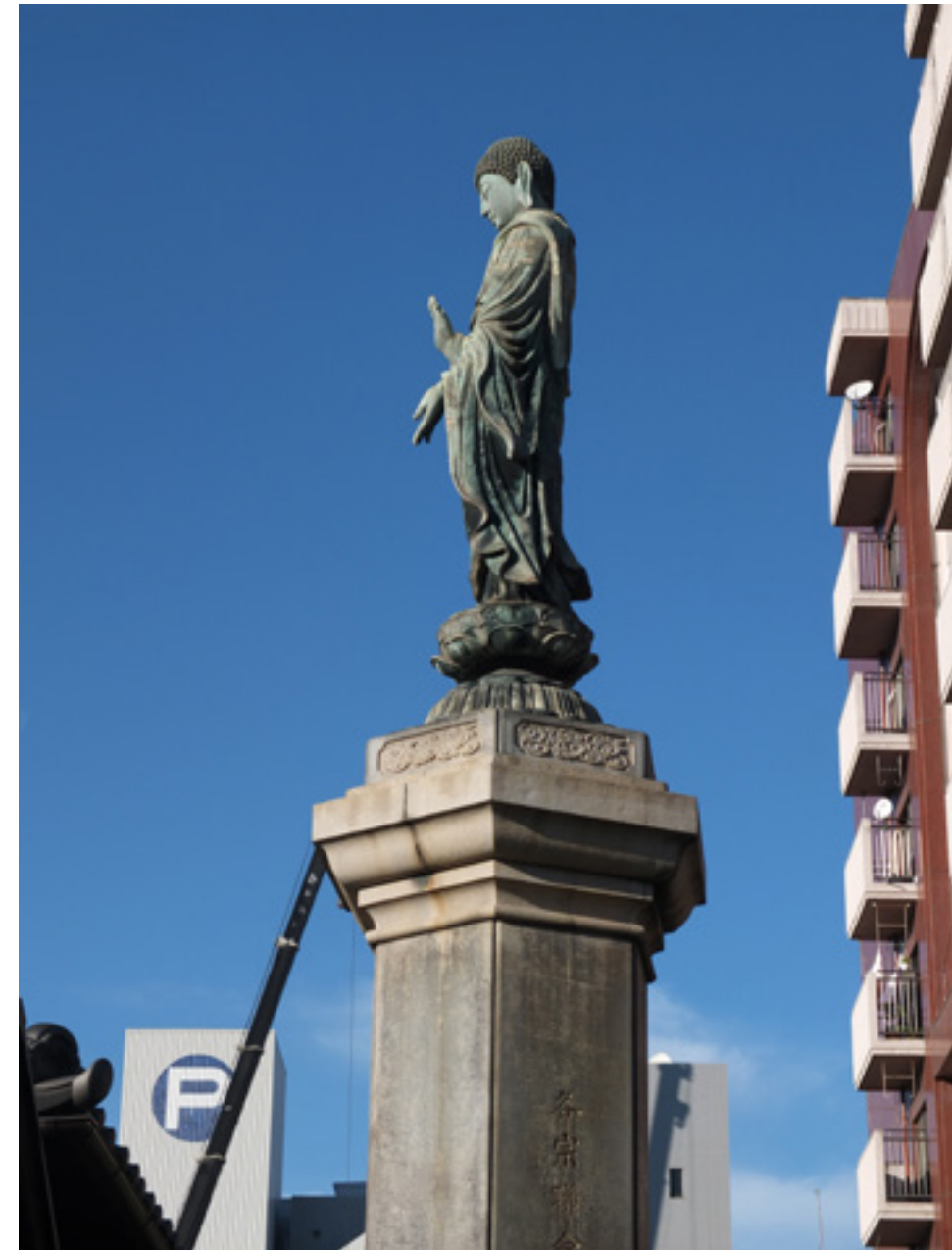
34°20'39.0"N 134°02'48.0"E Takamatsu

"An inspiration, an expiration, A progress, a removal, Life and death, coming and going. Like two arrow meeting in flight, In the middle of void, It is a road who lead straight to my true home."