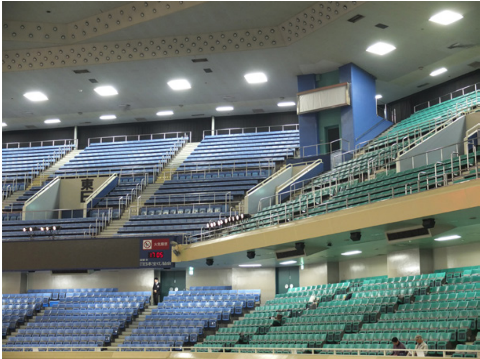
35°41'35.3"N 139°44'57.3"E Up-Right Tokyo