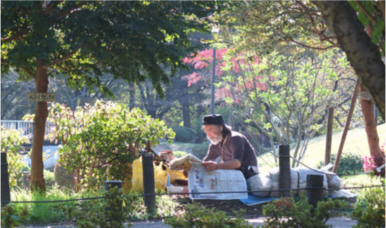
35°42'15.1"N 139°42'49.7"E Tokyo