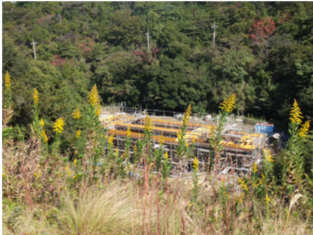
34°27'26.6"N 133°59'26.1"E Naoshima