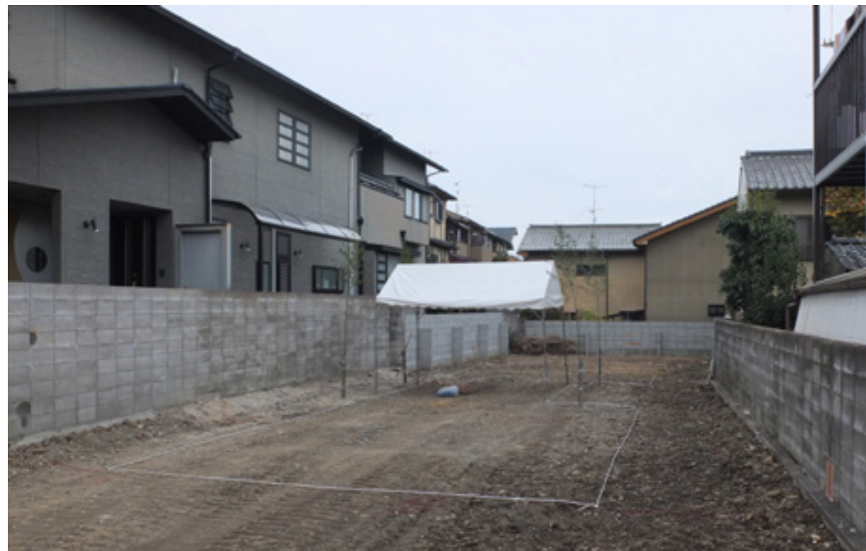
35°01'42.6"N 135°43'06.3"E Kyoto