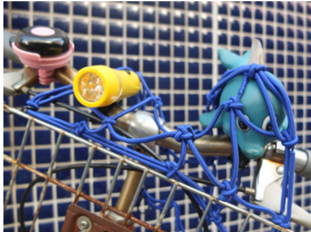
35°42'47.9"N 139°47'48.3"E Tokyo