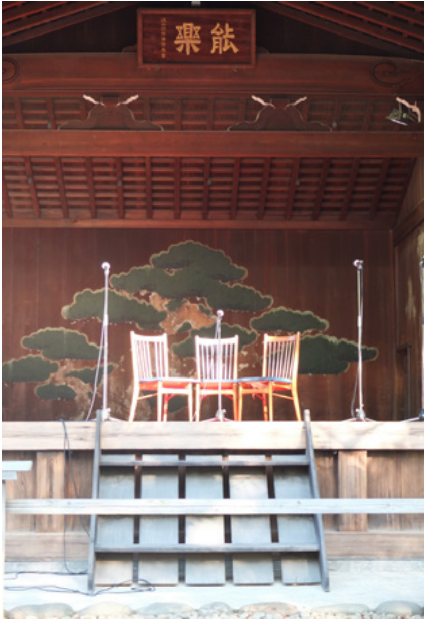
35°41'39.3"N 139°44'34.9"E Tokyo

* Your request will not be granted. *The patient will not recover soon. *The lost article is very hard to find. *Building a new house and removal are not well always. *Stop strating a trip. *Marriage and employment should be stopped.