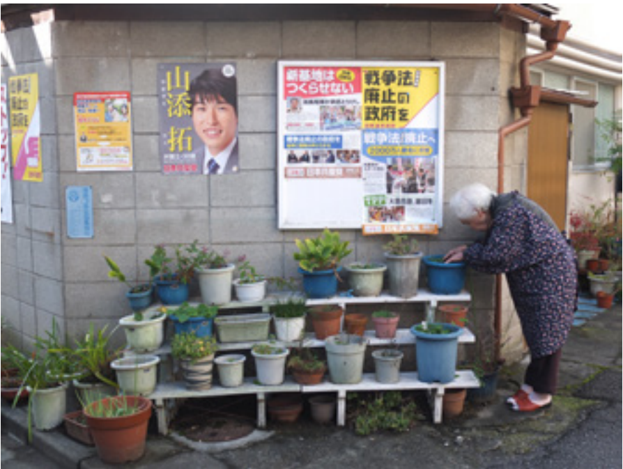
35°42'16.6"N 139°41'25.2"E Down Tokyo