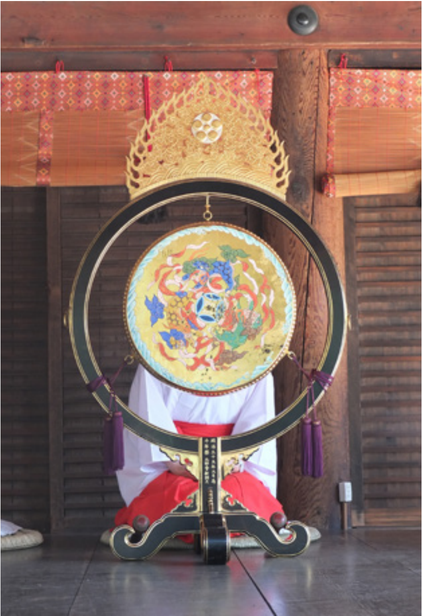
35°01'51.4"N 135°44'06.8"E Kyoto